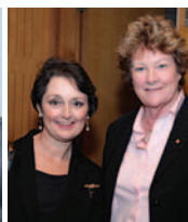
Pru Goward MP, Jillian Skinner MP.