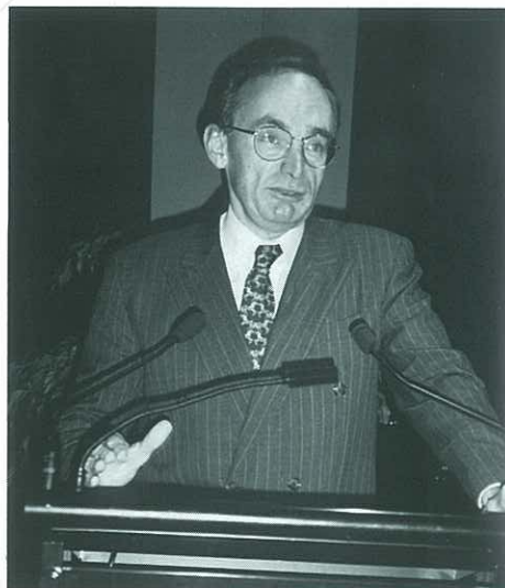
Bob Carr Premier, Minister for the Arts and Minister for Ethnic Affairs

A handwritten signature in black ink, appearing to read 'Bob Carr'.