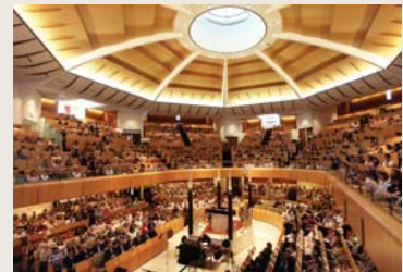
Section of the gathering at Central Synagogue.