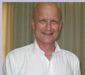
Anglican Bishop of Wollongong Alan Stewart.

Ben-Menashe did presentations on antisemitism, the Holocaust, the Arab-Israeli conflict and rites of passage.