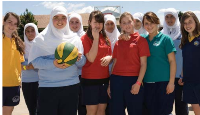
Students from Masada College, the Muslim Australian International Academy and Davidson High School during the Respect, Understanding and Acceptance program, which is aimed at breaking down barriers.