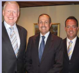
Shoalhaven City Council Deputy Mayor Gareth Ward, Board of Deputies CEO Vic Alhadeff and Shoalhaven Mayor Paul Green before Alhadeff addressed Shoalhaven City Council.