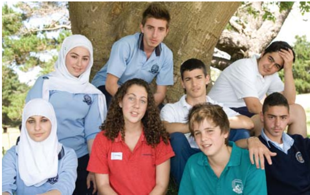
Students participating in the Respect, Understanding and Acceptance program.